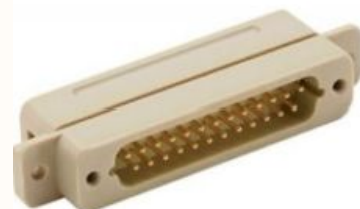
J1 - UHV Connector 25D Male PEEK PN 100421