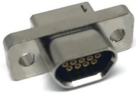
J2, J3, J4, J5 - 9 Pin Fem micro-dsub