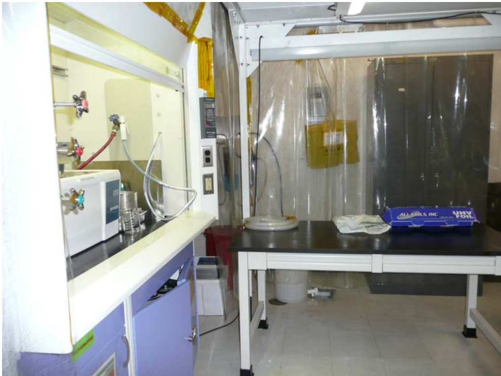
Figure 2.5 Flow chamber and table 1