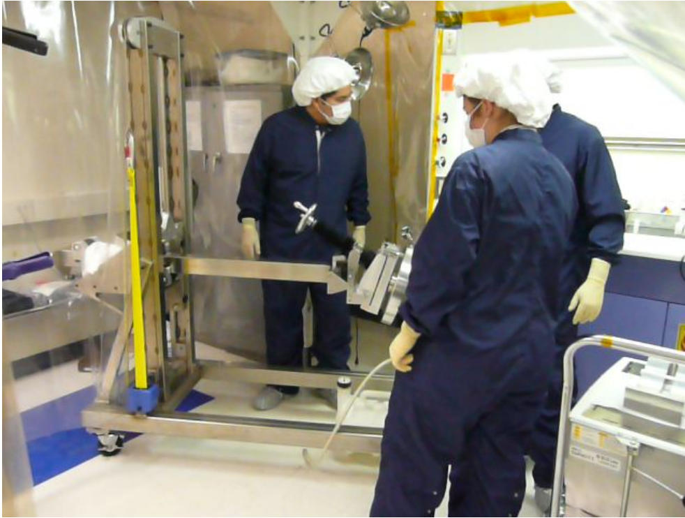
Figure 2.6 Using the ergo-arm in the clean room