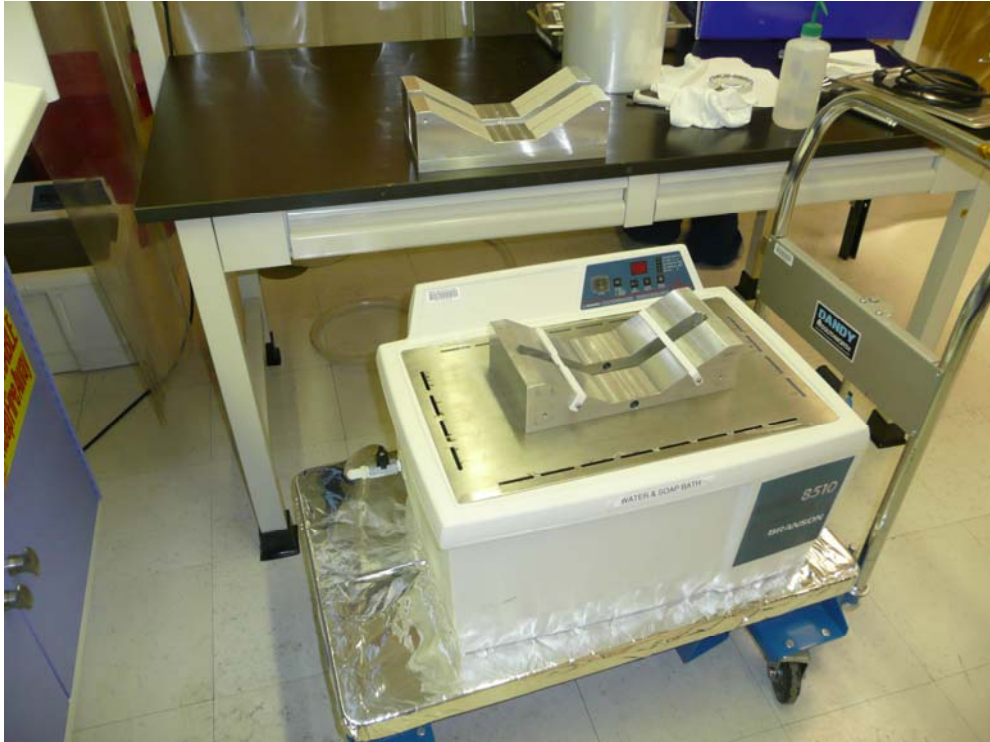
Figure 2.4 Washing trolley in front of table 1