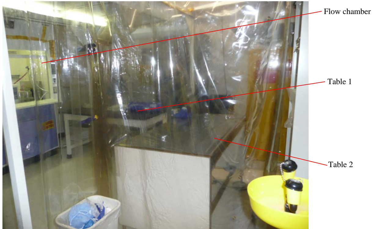
Figure 2.2 Lab from outside the cleanroom tent