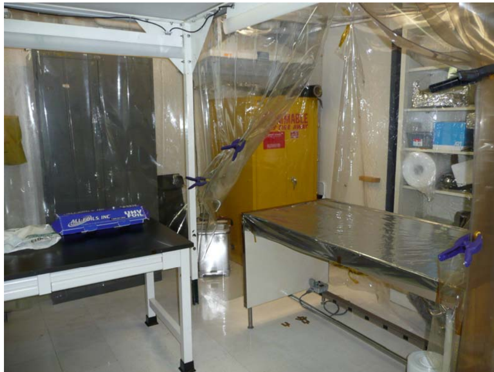
Figure 2.3 Two tables inside cleanroom tent