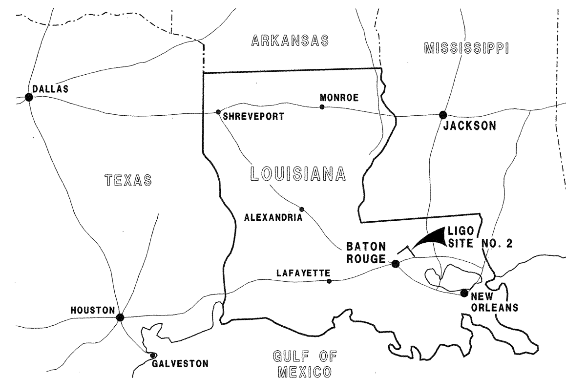
SITE NO. 2 LIVINGSTON, LOUISIANA