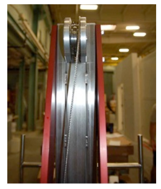
Figure 4: Wire laying to the right of its track

The thick steel wire that cranks the ergo arm up can hop out of its track like this: