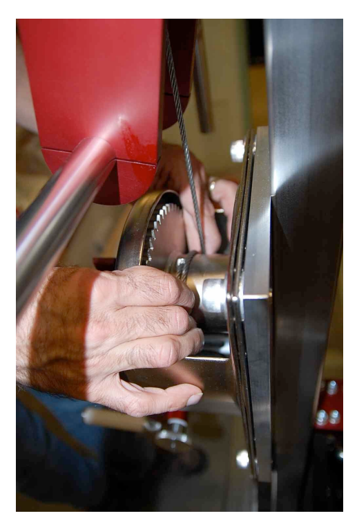
Figure 6: Fixing the wire, it should wind onto the spindle from left to right, viewed this way.

Figure 5: Winding too far to the right, it will start to wind up the right side of the arm.