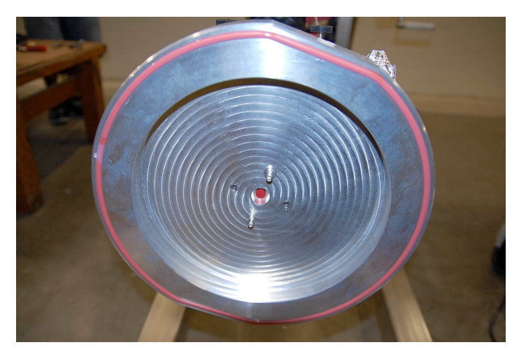
Figure 3: Spacers are in place and screws removed.

After putting in the spacers, remove the other two screws. The spacers keep the vacuum plate from falling off once all the screws are removed. Make sure the rotation brake(10) is backed off all the way, then wiggle the faceplate gently from side to side until it comes off. Keep in mind that there are small black o-rings in between the vacuum plate and the ergo-arm, don't knock these out of their tracks. Also make sure the Teflon rotation brake does not come off, there is no plate holding it on so the Teflon part can come off.