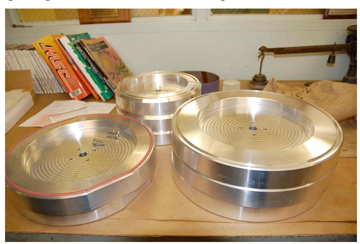
Figure 2: TM vacuum plate on left, FM's on the right and R's in the back.

The ergo-arm has three different vacuum plates, one to match each diameter of the large core optics. CPs, ERMs, ITMs and ETMS all use the 340 mm diameter vacuum plate, the one with flats. The 275mm diameter plate goes with the HLTS Recycling optics(SR3, PR3 and F-PR3), and the large 365mm diameter plate goes with the FM and BS optics.