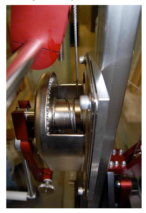
Figure 5: Winding too far to the right, it will start to wind up the right side of the arm.

Also, when the ergo-arm is lifted to its highest position and is being lowered back down, the operator has to make sure that the wire is winding on the crank spindle correctly, otherwise it can wind up the side of the spindle then drop suddenly.