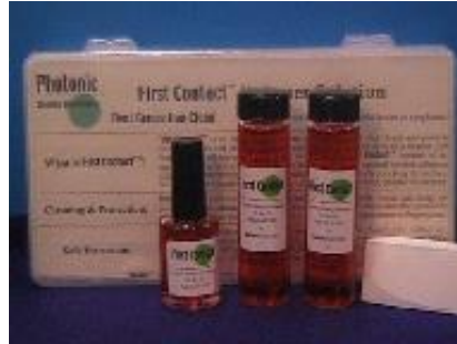
Figure 4: Small FC applicator bottle and two refill bottles.