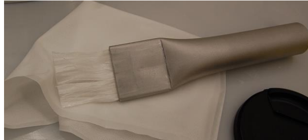
Figure 1: 1" aluminum handled nylon brush from Gordon Brush.