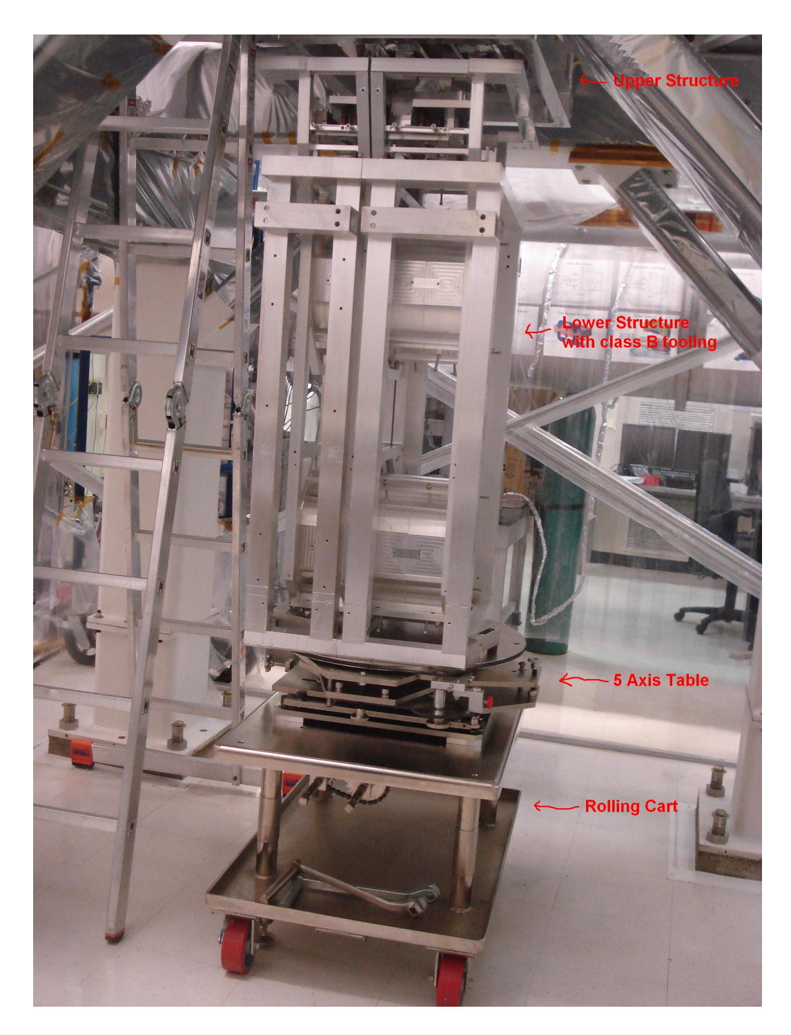
Figure 1: The 5 axis table, its wheeled cart, the lower structure, and the lower structure assembly tooling are all visible here. The red arrows point to these various components. At the top of the picture, part of the upper structure is visible and is shown to be seperated from the lower, which is irrelevant to the discussion in this document. While the upper structure can be turned with the lower disconnected, fine tuning the structure position usually requires referencing the optic.